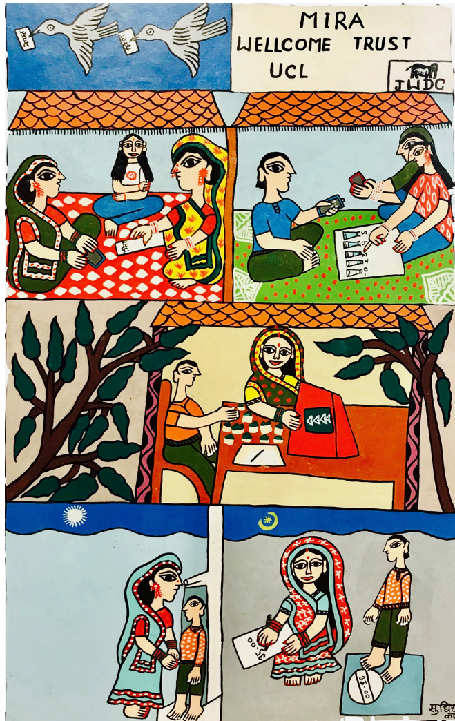
Figure 1 Mithila painting depicting consent taking, interviewing, and a child participating in the Universal Non-verbal Intelligence Test, Stroop test and anthropometry.

hindering children's chances in school and contributing to the intergenerational transmission of poverty. 5-9