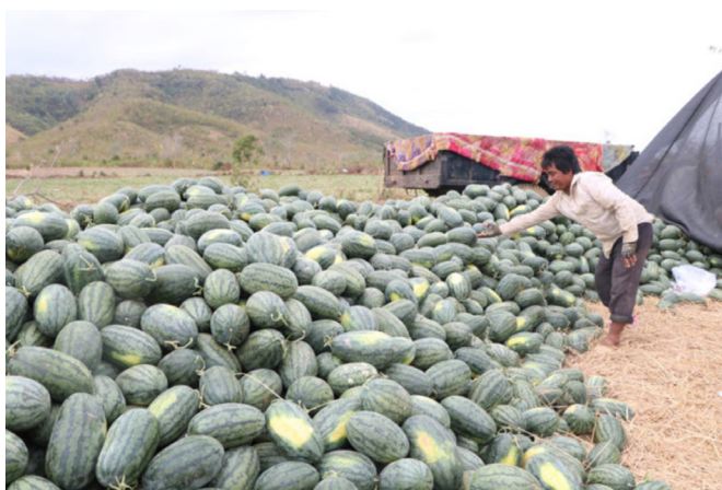
Figure 2 Heavy losses to watermelon farmers in Ninh Thuan Province due to COVID-19. 24

the hardest on dual fronts—the disease burden itself and the respective countermeasure burden.