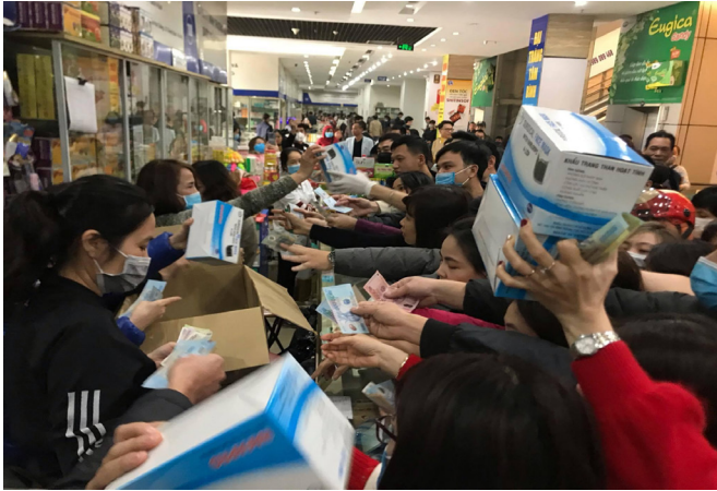
Figure 1 A sudden surge of demand for preventative goods, including hand sanitisers and face masks (Adapted from Vietnamnet). 23

hand sanitisers and face masks—as illustrated in figure 1 , has led to the price increase of these consumables three- to ten-fold. If a household of four people uses on average eight masks a day with each mask costing 6,000 VND (US$0.25) apiece, the family is required to spend a minimum of 1.5 million VND (US$60) a month—roughly 20% of their monthly income on masks alone. National television has estimated that with the purchasing pattern during the initial period of the outbreak, in major cities alone: over 50 billion VND (US$2 million) could have been spent out-of-pocket (OOP) per day on masks. 8