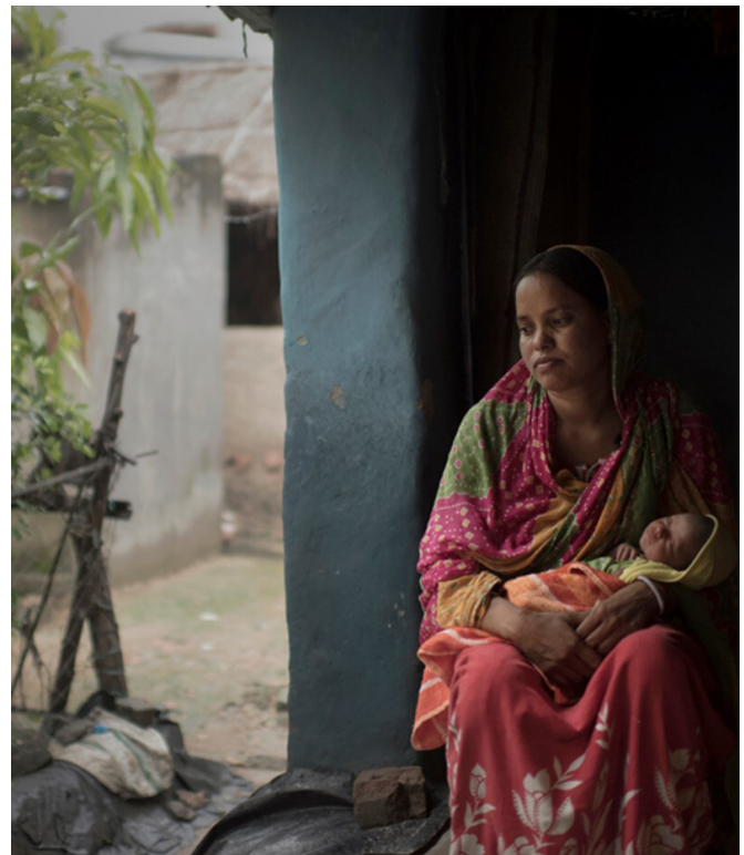
Figure 1 Many women face obstacles to seeking care in health facilities for themselves or their newborn baby.

The catalogue of problems highlighted in table 1 poses a huge dilemma for MNH care. Will deterioration of facility-based care shift the balance of risk to women and newborns from benefit to harm, so challenging the strategic recommendation for facility deliveries? If so, what choices are there for pregnant women and service providers? Should we revisit risk screening approaches and strengthen ANC so that women at lower risk can be advised to give birth in primary care facilities or in separate midwifery units? How can quality be maintained or improved? Once again, responses are emerging from reports on the ground; the final column in table 1 summarises some local solutions to context-specific problems from our online survey and webinar. Collectively, these local adaptations and responses may protect