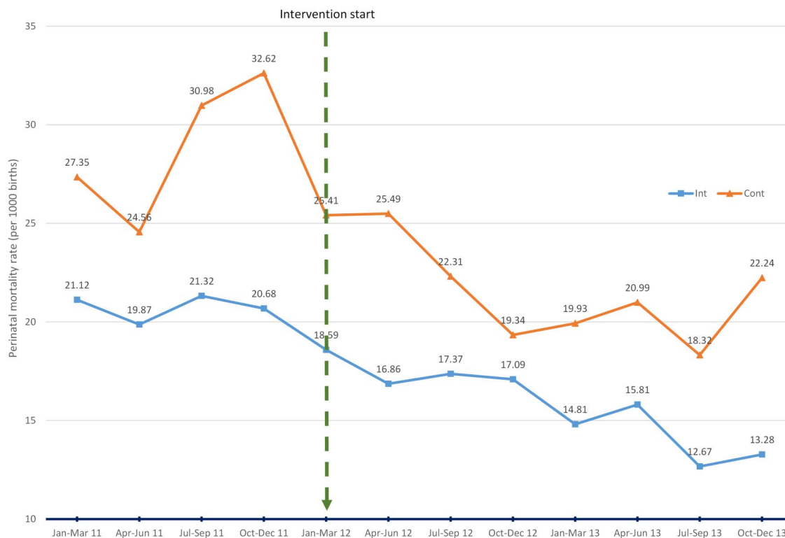
Figure 2 Interrupted time series: district health facility perinatal mortality rate (per 1000 births) comparing intervention districts (Int) with control districts (Cont).

However, comparison of the standardised relative effects shows that there is a consistent reduction in the intervention districts compared with a consistent increase in the control districts (table 3). Figure 3